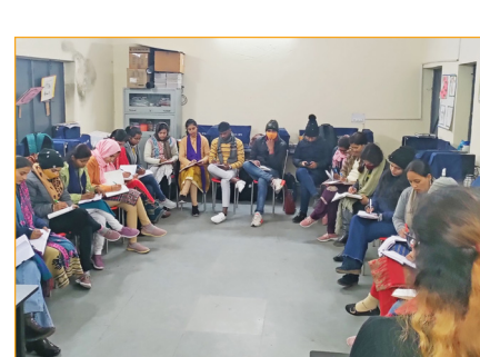
Leher with Remedial and computer teachers and counsellors at Etasha Society

We embarked on two new Leher collaborations in the final quarter of the year.