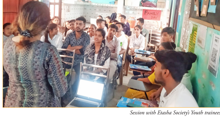
Session with Etasha Society's Youth trainees

Between January to March, we reached out and facilitated awareness sessions broadly focusing on personal safety, child protection and creating safe classrooms. We facilitated 10 sessions with 3 organisations and 1 college.