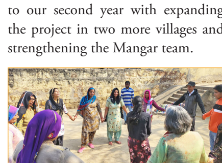
Playing a game on safety as a collective responsibility with the parents of adolescents in Mangar

We also held a successful fundraising event that raised much needed funds for our Safe Spaces Project in Mangar, Haryana. We look forward to our second year with expanding the project in two more villages and strengthening the Mangar team.