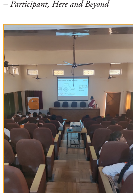
An awareness session at Shyamal Saraswati Maha Vidyalaya, Bulandshahr