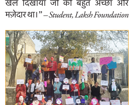
Students showcasing their puppets post the puppet show

“मैंने यहाँ कठपुतली बनाया और सीखा और कठपुतली का खेल देखा जो मुझे सबसे अच्छा लगा। कुछ ऐसे खेल खेले जिनमे मुझे बहुत मजा आया और मुझे सारे लोगों से मिलकर बहुत अच्छा लगा। हम सभी ने गांव में जाकर कठपुतली का खेल दिखाया जो की बहुत अच्छा और मजेदार था।” – Student, Laksh Foundation