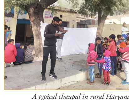
A typical chaupal in rural Haryana

A Baatcheet session on 'Safety Issues related to gender based violence in Haryana' was organised for organisations working on gender in Haryana. The organisations included Navjyoti Foundation, SMART, Gender Lab, Etasha Society, Breakthrough and Laksh Foundation. The organisations spoke about their interventions in place, their demography, issues arising and cases they encounter and the challenges they face while working in communities. It was recognised how the chaupal (a common place) is an extremely political and gendered place in the community that perpetuates gender inequality and provides no place for expression to children. From women being restrained to step upon the chaupal to different castes having their separate chaupals.