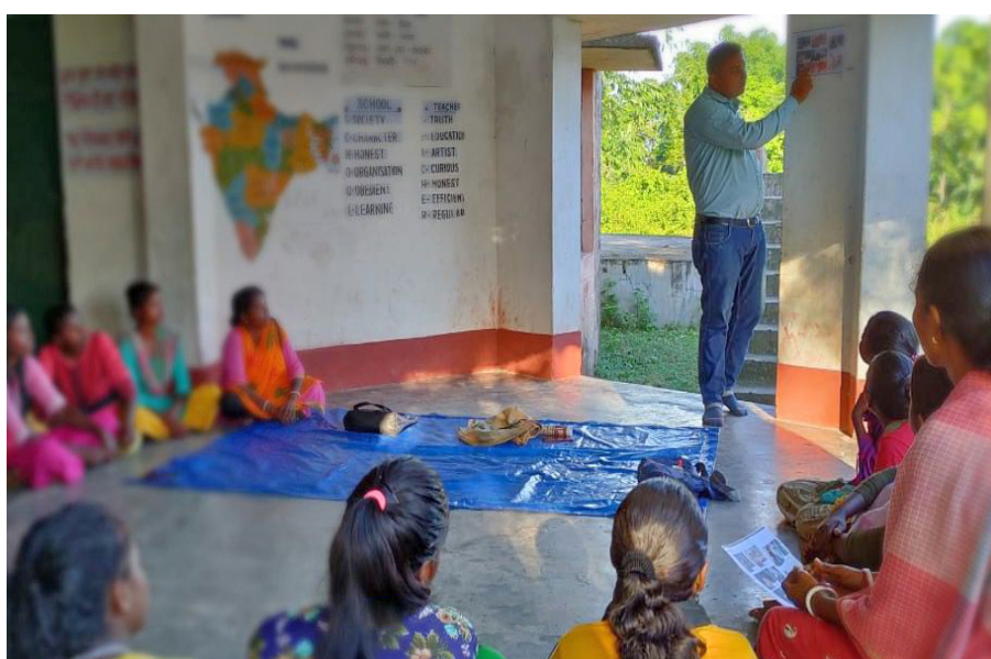
Use of the participatory tools by the Vihaan field team at Vihaan

and WWS, Belgaum to build the capacity of 13 members of their teams in using participatory research tools to include the voices of children in a baseline assessment of a community in the context of abuse, violence and exploitation. The baseline assessment is to be done in Kishanganj - Bihar and Belagavi - Karnataka. Both regions are hot spots for human trafficking. The tools have been used by the Bihar field team in their work with adolescent girls in rural Bihar and helped them to unearth new information and perspectives from the children. The partnership with Vihaan-WWS promises to help us reach out to more vulnerable communities and critical stakeholders in Bihar.