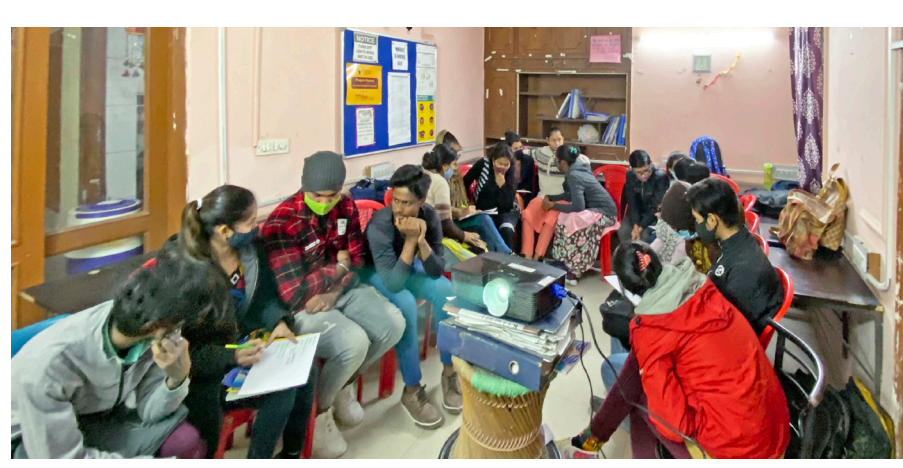
Awareness session for youth trainees at Etasha