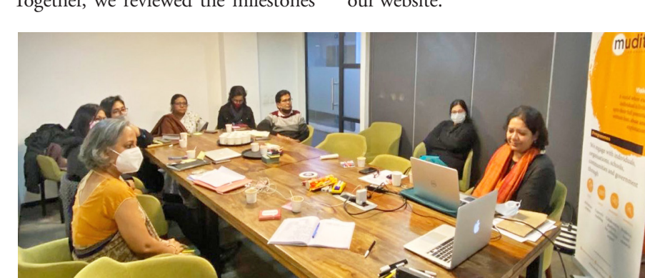
First Annual Leher Confluence, Dec 2021

achieved, the challenges faced and the objectives for future endeavors. The Confluence ended with a renewed commitment to integrate safety into all the core programmes of the partners, holistically and collectively. A report on the same will soon be available on our website.