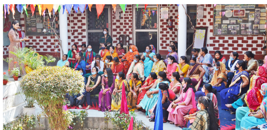
Awareness session with women at Navjyoti Foundation.