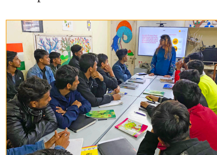
An awareness session at Ritanjali