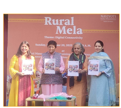
The release of our baseline study by Dr Kiran Bedi