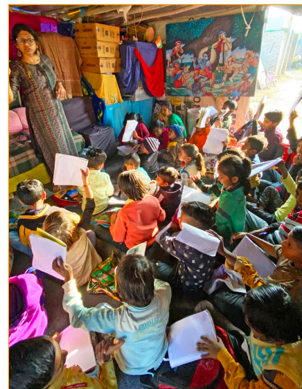
A session on personal safety with 5-9 years old in Fatehpur Beri Village

Our monthly sessions with Etasha Society's youth groups continued. We met one group at their centre in Mangolpuri, Delhi and another group online for the sessions. In November and December, we met their team online for two workshops on preventing Sexual Harassment at Workplace and the POSH Act. The session held in December was attended by all the Internal Committee members to gain a better perspective on the functioning of Internal Committee.