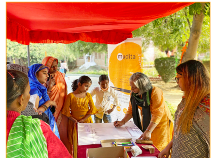
Mudita's team interacting with the community members at the Rural Mela