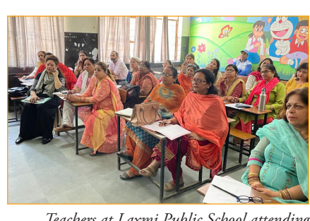
Teachers at Laxmi Public School attending our workshop