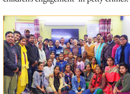
A group picture with the Urban Education Program Team at Navjyoti India Foundation

the team were- child labour, corporal punishment, domestic violence and children's engagement in petty crimes.