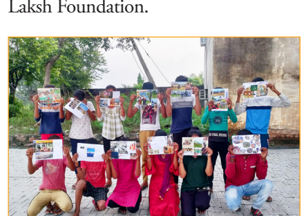
Collages made by the adolescent group

It is now the third quarter of our pilot project in the Mangar village of Haryana in collaboration with Laksh Foundation.