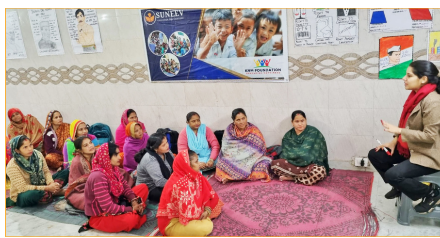
Session with mothers at Khanpur

Between October and December this year, we reached out to a wide range of stakeholders through 16 awareness sessions with 6 organisations and 1 school on safety related issues. Interacting with some old and new collaborations, we conducted sessions online as well as in person.