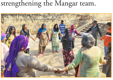
Playing a game on safety as a collective responsibility with the parents of adolescents in Mangar

workers to brief them about the safe spaces project, and enlist their support towards creating Mangar a safe space. We also held a successful fundraising that raised much needed funds for our Safe Spaces Project in Mangar, Haryana. We look forward to our second year with expanding the project in two more villages and