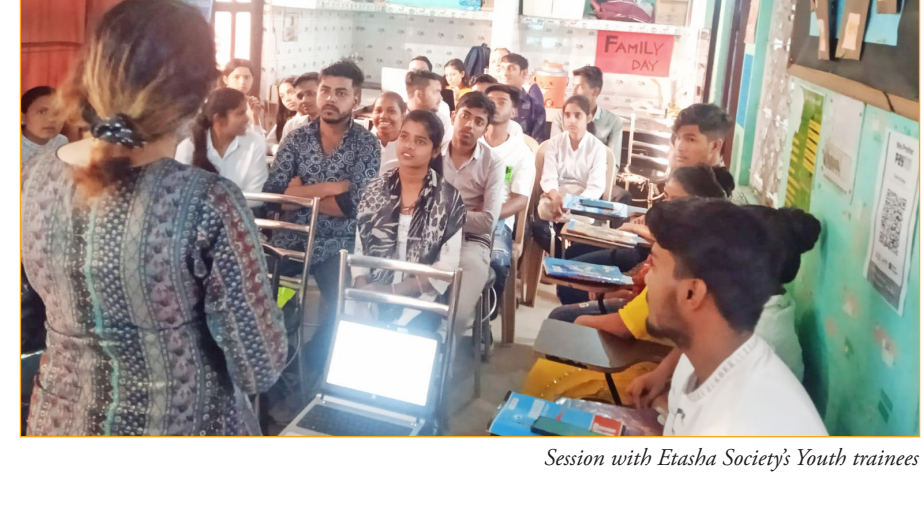
"Mudita Foundation is doing a great job by spreading awareness on very

awareness sessions broadly focusing on personal safety, child protection and creating classrooms. We facilitated 10 sessions with 3 organisations and 1 college. Etasha Society Our monthly sessions with the Etasha