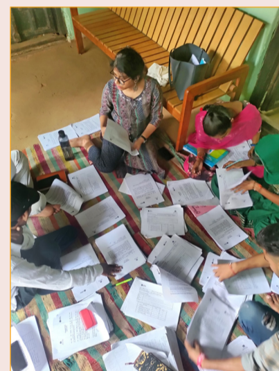
Collation of data for the community survey

Learning and sharing for children and youth in the community leading to increased resilience