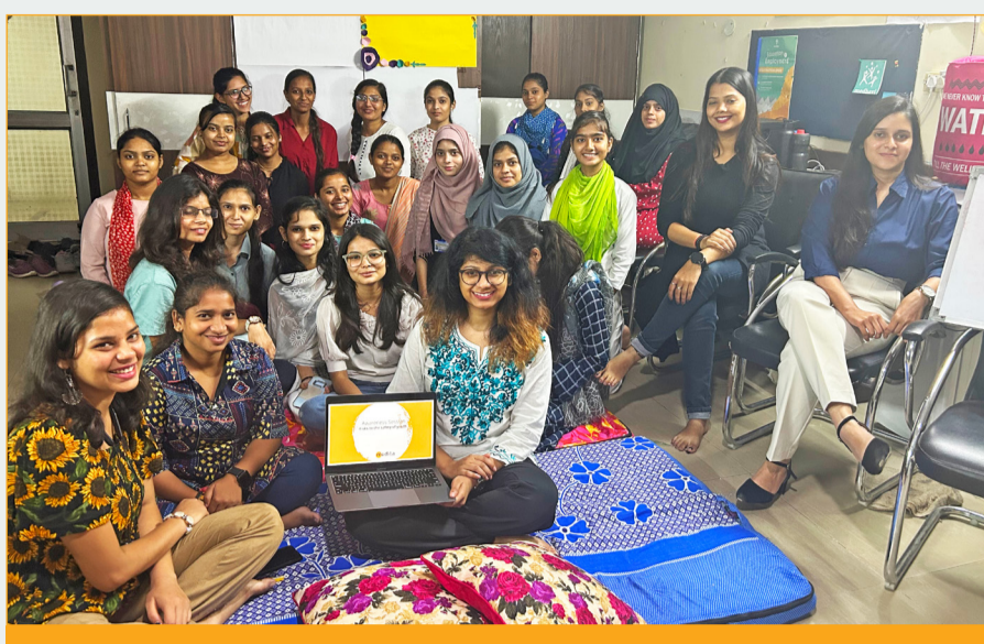
Awareness sessions with Medhavi youth members