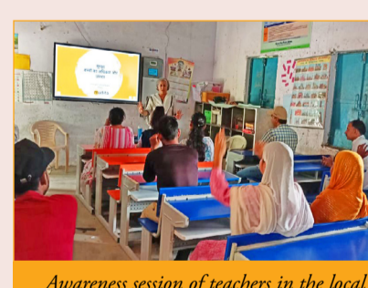
Awareness session of teachers in the local govt. primary school

A total of 9 visits were made to the three villages of Faridabad where we are executing our 'Safe Spaces Project' with Laksh Foundation. In the village where we started our pilot last year, we finally completed an extensive survey on understanding awareness of children (aged 10-18 years) about their rights and entitlements in context of risk and protection from abuse, violence and exploitation. Data from over 300 children in the village has been collected and this mammoth task would not have been possible without the dedicated efforts of all the teacher trainees who have been a part of our project since last year and about 15 members of the adolescent group.