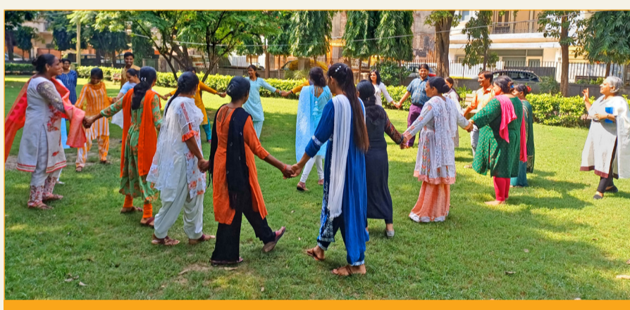
Games and activities as part of the capacity-building of teachers from Chintan