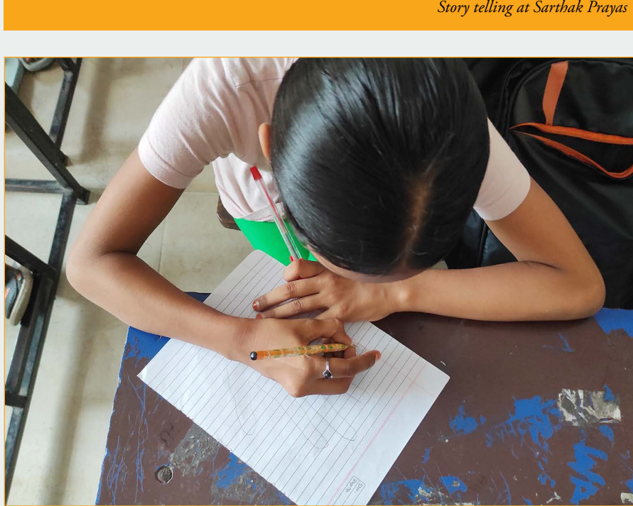
Building the safety circle