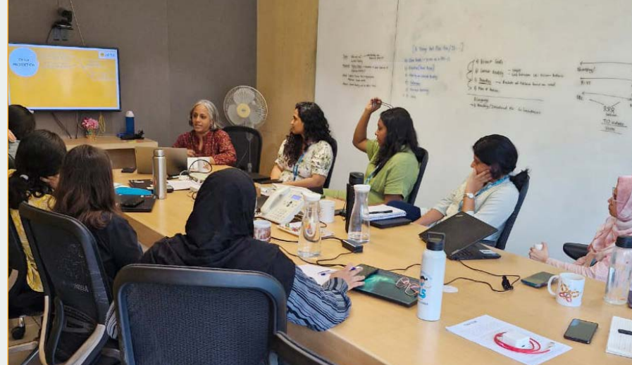
With the Teach For India team in Mumbai

The more we work with children, the more we realise the increasing need of initiating personal safety conversations with children.