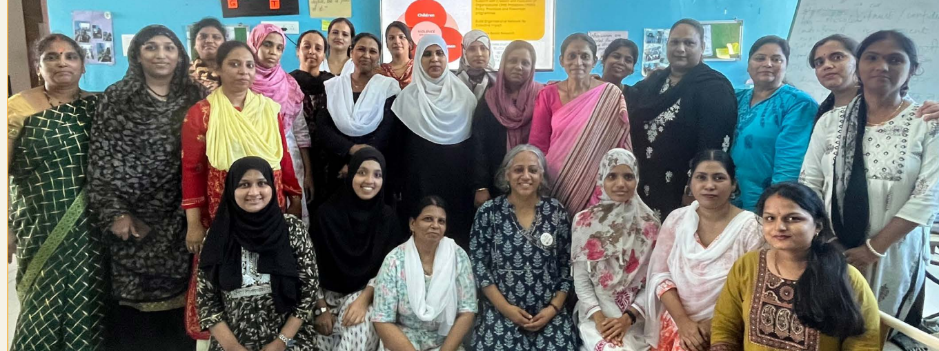
A group snap with the teachers at CHIP Mumbai

A new collaboration with CHIP Mumbai was initiated this quarter with the support of Rotary Club of Bombay Hills South Charities.