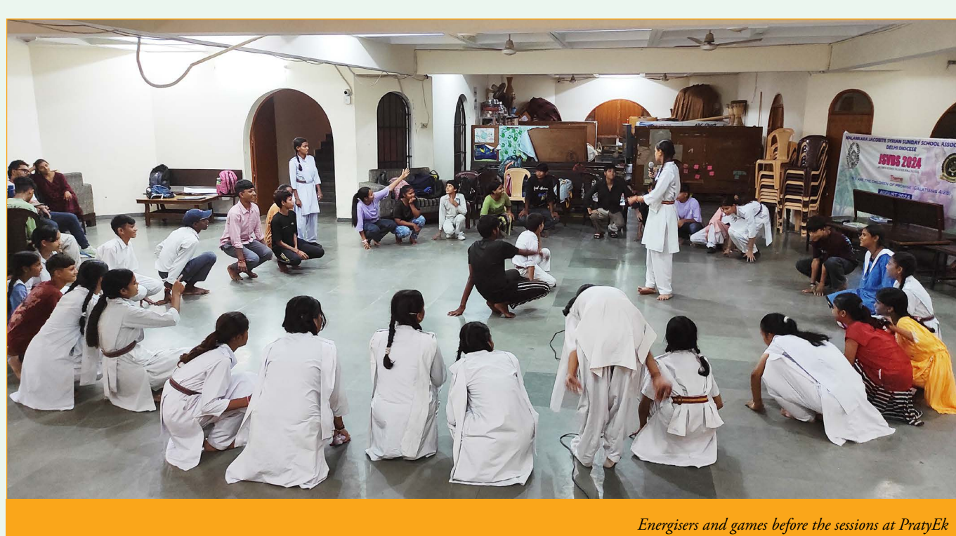
Energisers and games before the sessions at Pratyek