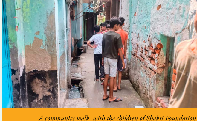
A community walk with the children of Shakti Foundation

At Laksh Foundation, we revisited Manger village in August to interact with the secondary school teachers of the government school. A session on child protection and the POCSO law was organised and attended by 6 teachers. In the evening we met our adolescent safety champions and helped them recap some information related to types and forms of abuse. Together we also reflected on their role as safety champions in the village and how they have been exploring more possibilities to initiate safety related conversations with other members of the community.