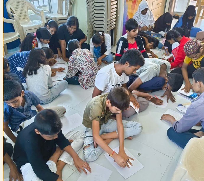
Activities with the adolescents of CHIP Mumbai

- हमें बहुत कुछ पता नहीं था जैसे की हेलप लाइन नंबर क्या है और कौन कौन से कानून बनाये हुए हैं | इनके बारे में जानकारी मिली | - adolescent participant, CHIP Mumbai