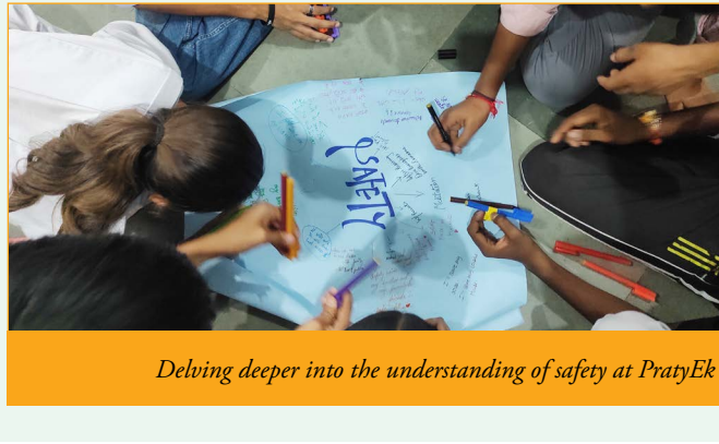
Delving deeper into the understanding of safety at Pratyek