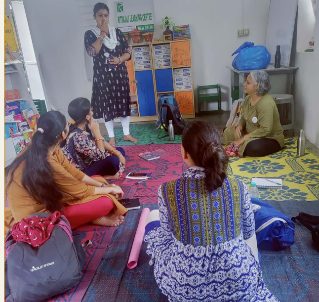
Teachers demonstrating tools at Ritinjali