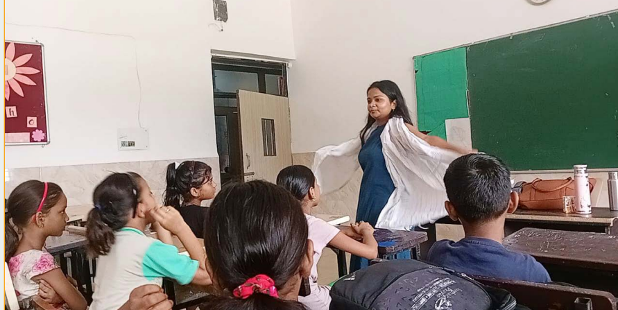
Story telling at Sarthak Prayas

- Got more clarity on points of behavior. Attended a session like this for the first time, so it was very helpful. Good that we had it now before the trips. We will remember better. - Instructor, Alternate Atlas