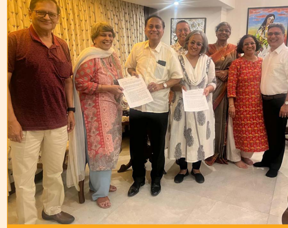
Signing of the MoU with RCBHS

If you too can support our work in some capacity and help us build a safer world for more children, please contact us at mudita@muditafoundation.in to explore opportunities of collaboration.