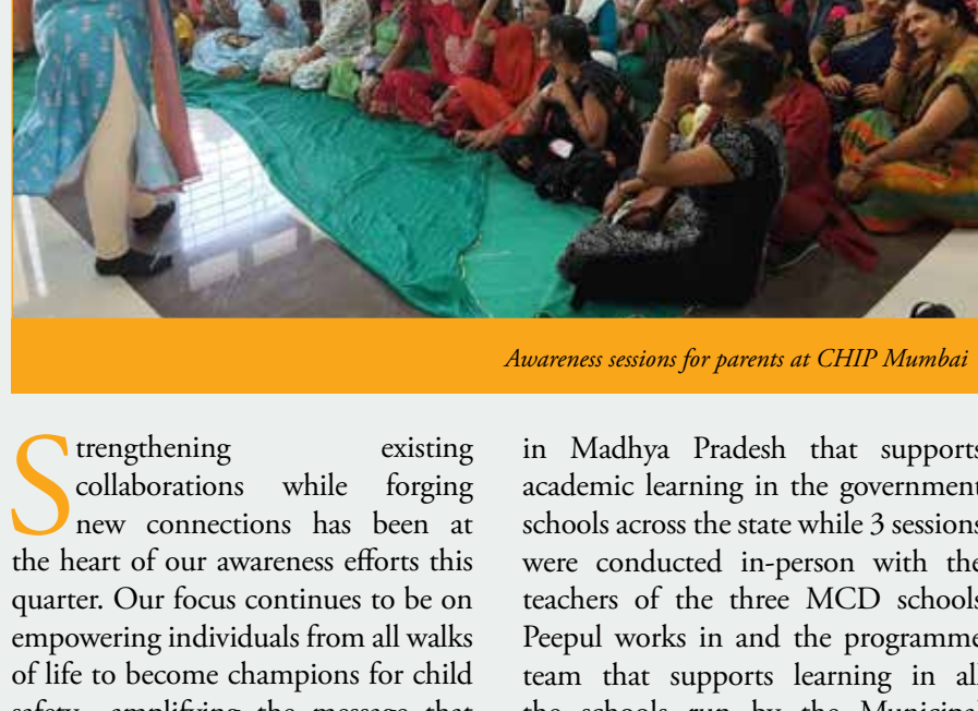
Awareness sessions for parents at CHIP Mumbai

Strengthening existing collaborations while forging new connections has been at the heart of our awareness efforts this quarter. Our focus continues to be on empowering individuals from all walks of life to become champions for child safety—amplifying the message that protection is a shared responsibility.