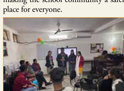
Leher program with the youth at Ritiinjali

Our interventions to support the Loreto Schools continued with another group of 30 Internal Committee members in January in Kolkata. With this, each of their schools now has established Internal Committees with trained members, who went back to conduct awareness sessions in their schools and submitted their Annual Reports in January. Each of the trained Child Protection Officers and Internal Committee Members are now working towards building awareness and collective responsibility towards making the school community a safer place for everyone.