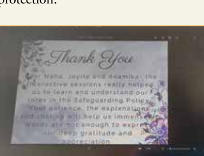
Online meet with the Principals of Loreto group

successful execution of this campaign is exemplary as it reinforces the impact that can be created through innovative community spaces and collective efforts in ensuring child safety and protection.