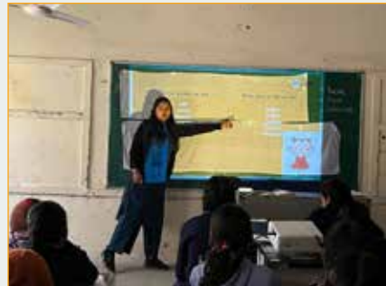
Personal Safety sessions with the Teach For India students at Sangam Vihar

A new partnership flourished with Peepul, an organisation that helps improve government school education by empowering teachers, creating high-engagement classrooms & strengthening school administration and the system. 2 sessions were conducted online with the team