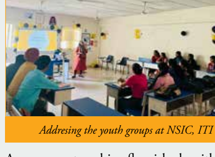
Addressing the youth groups at NSIC, ITI

We conducted awareness sessions with Bachelor of Education students at Loreto College, Kolkata as they get ready to become teachers and create safe classrooms. We also conducted an awareness session with support staff at Loreto College on creating safe and respectful workplaces for all with a focus on the law protecting women.