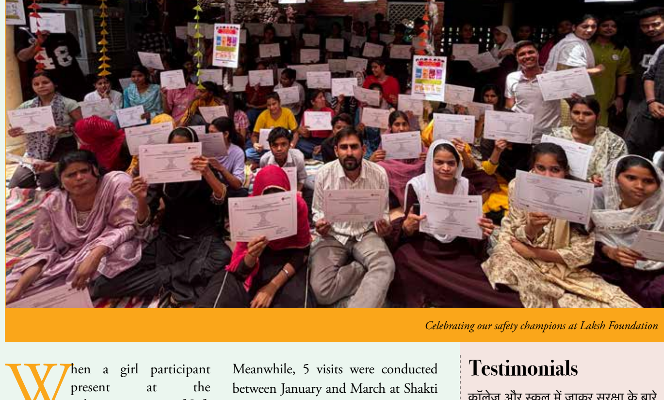
Celebrating our safety champions at Laksh Foundation

When a girl participant present at the culmination event of Safe Spaces Project at Laksh Foundation said, 'लग रहा है जैसे आज सेफ्टी की शिद्दी है', we were amused. Yet it left us wondering, what made her think that. Indeed the event was nothing less than a celebration. There was music, dance, reflections, activities and acknowledgement of the hard work put in by all the adolescents who had been participating in Safe Spaces activities over the last three years. All the efforts of our safety champions were recognised with certificates and badges, even as they pledged actions they will take for their own safety, the safety of their friends and their communities. The highlight of the event was Manzil Mystic's energetic musical performances and the composition built by them and all the safety champions together on safety with a chorus that echoed - सुरक्षा है जरूरी, मलिकर करे पुरी |