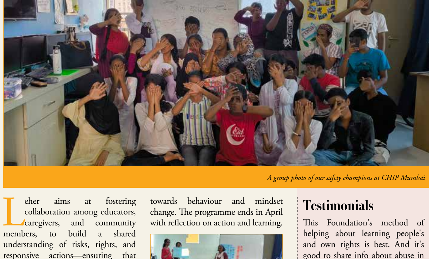
A group photo of our safety champions at CHIP Mumbai

Leher aims at fostering collaboration among educators, caregivers, and community members, to build a shared understanding of risks, rights, and responsive actions—ensuring that child protection becomes a sustained and community-owned responsibility.